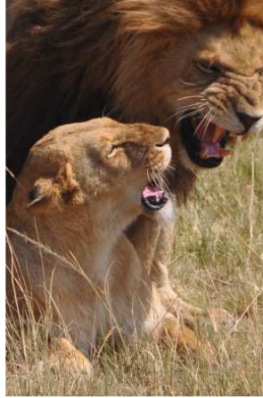
Lions in Harmony